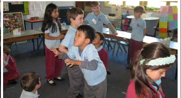
Drama in the classroom