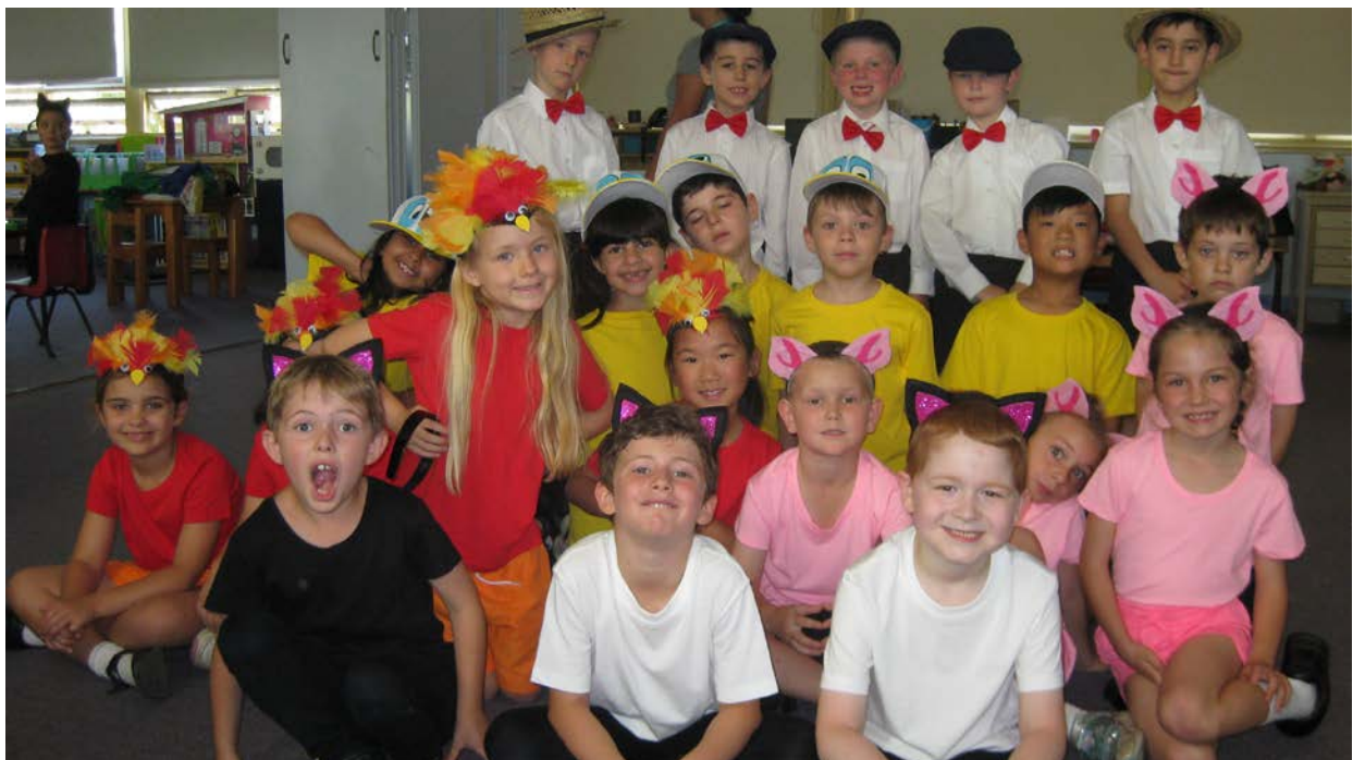
Class 1B before the dress rehearsal

More images will be posted on our website soon.