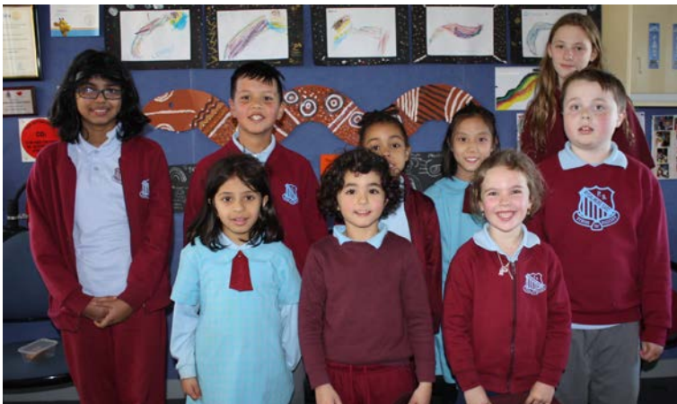
Keeping our hands and feet to ourselves.