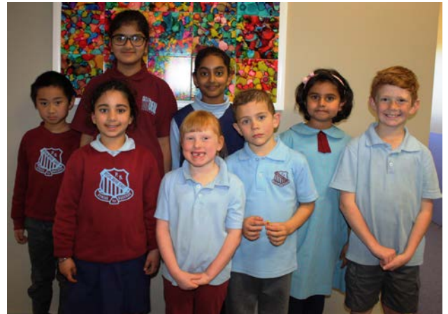
Using nice words and speaking politely.

Our Term 3 Week 1 PBL Expectation was to be respectful by using nice words and speaking politely. Congratulations to the following students who were rewarded for following this expectation.