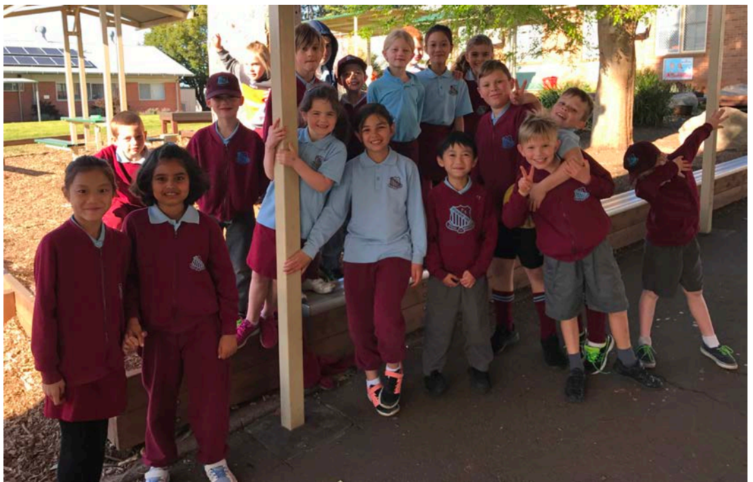
Scenes from the Fathers' Day Breakfast